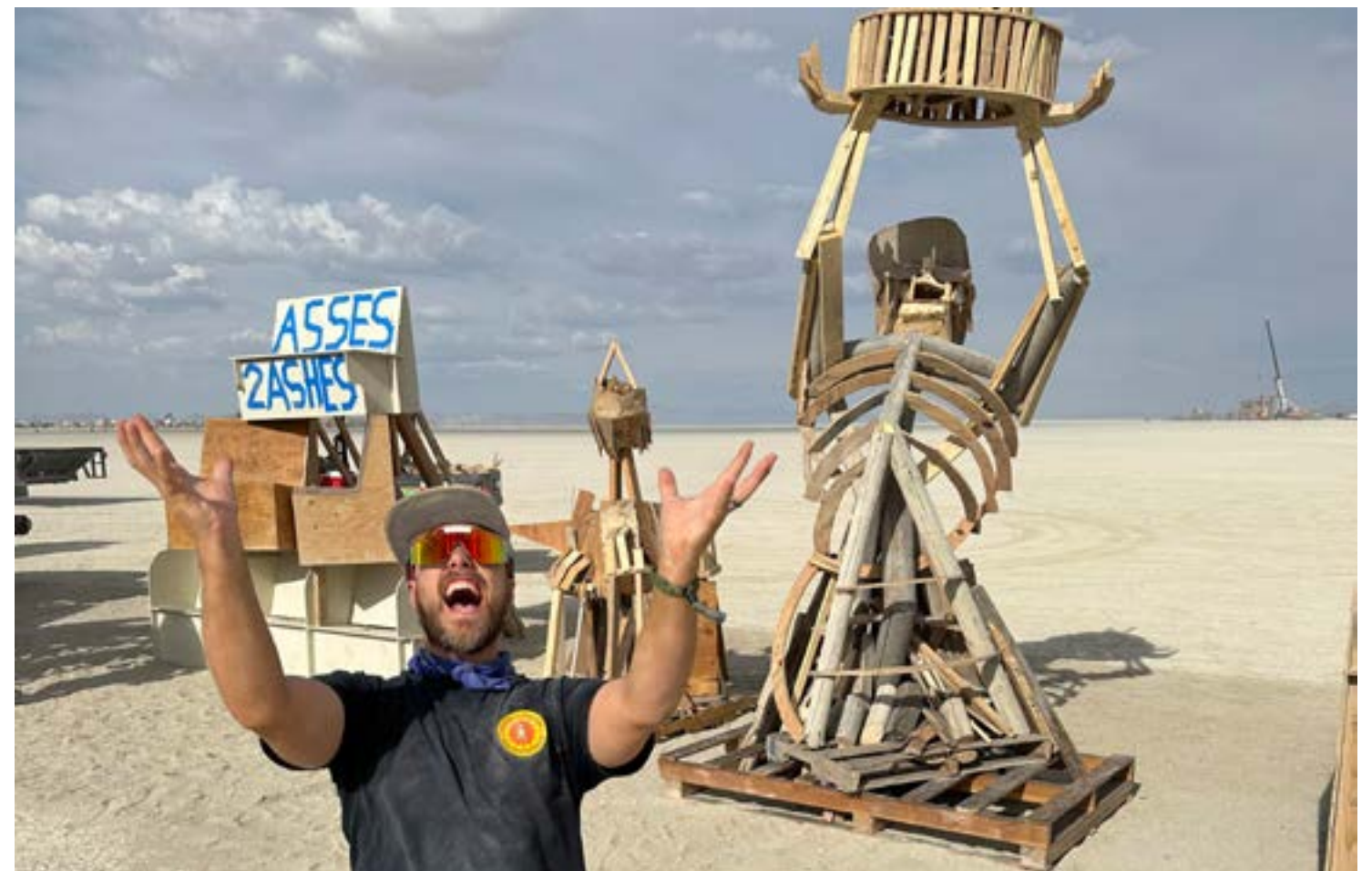
Sweet Ride in front of the BLM Early Man’s 2023 project.